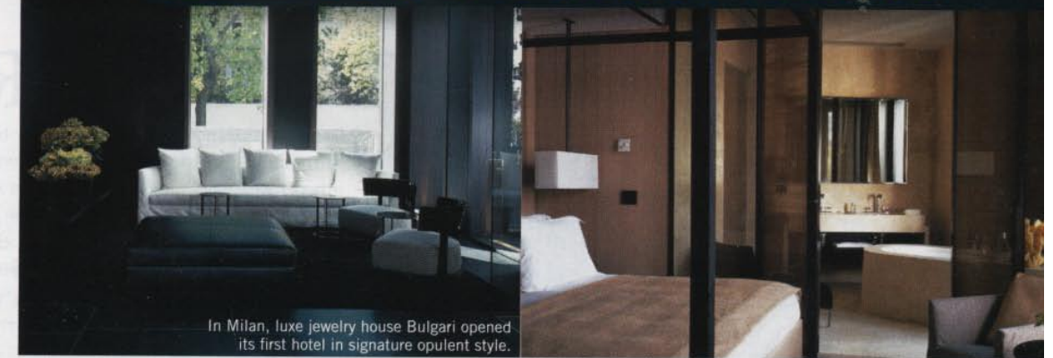
In Milan, luxe jewelry house Bulgari opened its first hotel in signature opulent style.

If you prize individuality (and don't mind paying for it), Confederate Motorcycles' Hellcat was made with you in mind. The New Orleans boutique workshop builds the Hellcats in batches of five or fewer, so you won't meet a clone at the next red light (we're told Brad Pitt loves his). Confederate's website, which also quotes T.E. Lawrence on the joys of cycles, speaks of the company's "fanatical devotion to the perfection of motorcycling." The Hellcat more than backs up the boast. This year's new F113 Hellcat (pictured above), with its proprietary radial-twin engine, adds to the company's proud lineage of superior bikes. From $61,800, (504) 561-9122, www.confederate.com — CHRIS TUCKER